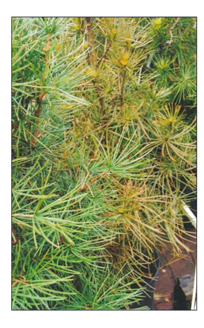
Fig. 2. Needle and stem parts browning of S. verticillata incited by P. citrophthora

dron were used for inoculation of stem parts and leaves of rhododendron. Cultures were maintained on Potato Dextrose Agar (PDA) at 25°C for 7 days. Three mm diam mycelium discs overgrown by P. citrophthora were transferred to the base of the tested organs in photographic trays. The length of necrosis was measured within the 6 day-incubation period. Experimental design was completely randomized with 4 replications and 5 plant organs in each rep. Trials were repeated twice.