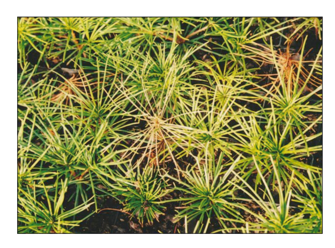
Fig. 1. Needle yellowing of S. verticillata incited by P. citroph-thora

likowski and Szkuta (2001) was used for isolating microorganisms from diseased plant tissues. Over the span of 3 years, 50 diseased plants were analysed. Rhododendron leaf baits and the procedure described by Themann and Werres (1998) was used for the detection of Phytophthora spp. from the substratum. Obtained isolates were grouped by growth pattern and their morphology. Representative cultures were identified to species on the base of morphology features and confirmed by molecular methods (Èrsek et al. 1994; Trzewik et al. 2006, 2010).